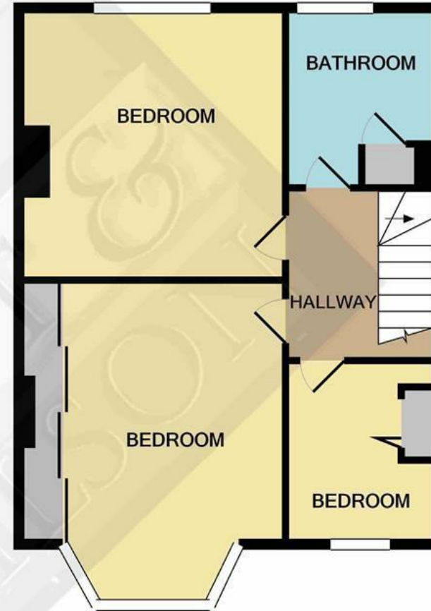
1ST FLOOR APPROX. FLOOR AREA 460 SQ.FT. (42.7 SQ.M.)

TOTAL APPROX. FLOOR AREA 981 SQ.FT. (91.1 SQ.M.)