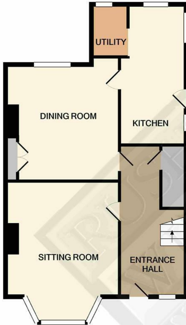
GROUND FLOOR APPROX. FLOOR AREA 521 SQ.FT. (48.4 SQ.M.)